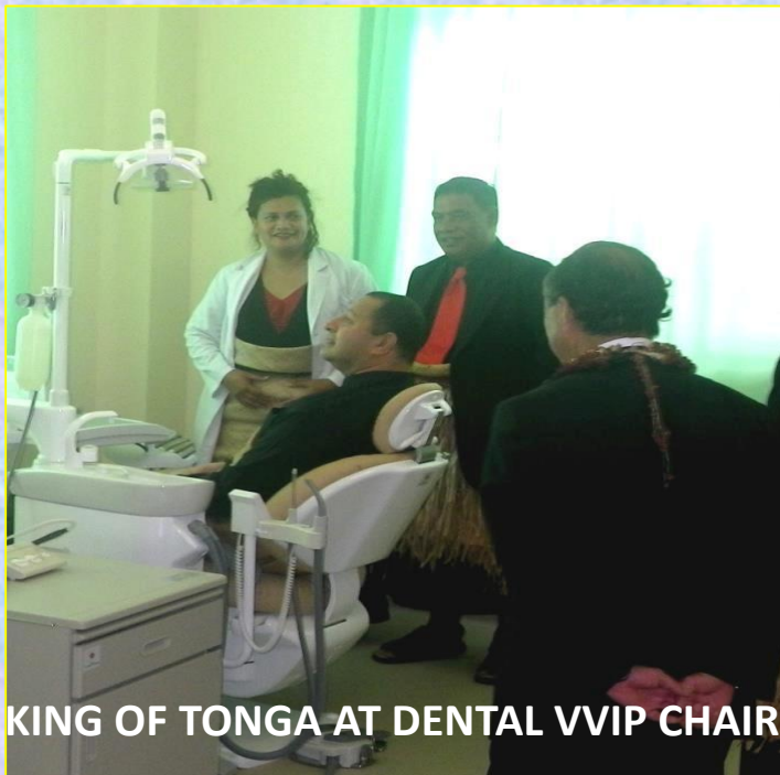
KING OF TONGA AT DENTAL VVIP CHAIR

OFFICIAL OPENING OF NEW VAIOLA HOSPITAL DENTAL CLINIC BY KING TUPOU VI IN 2012