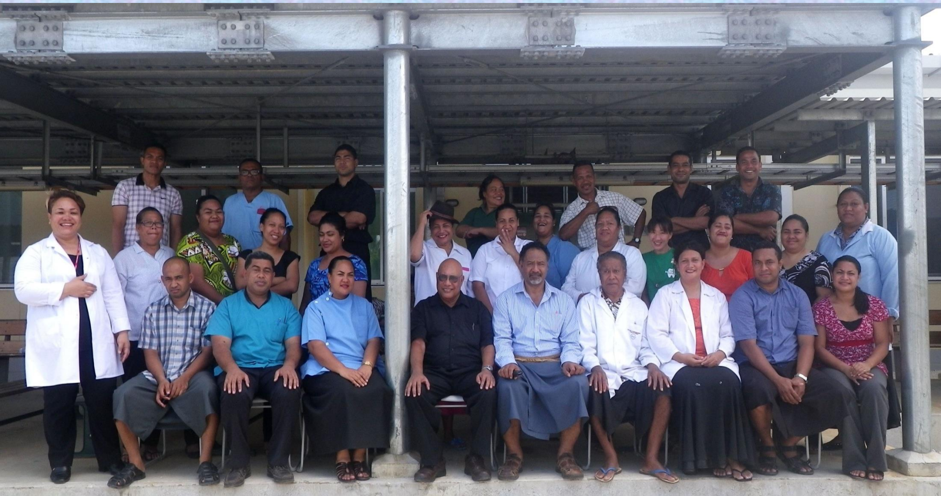
TONGATAPU DENTAL STAFF