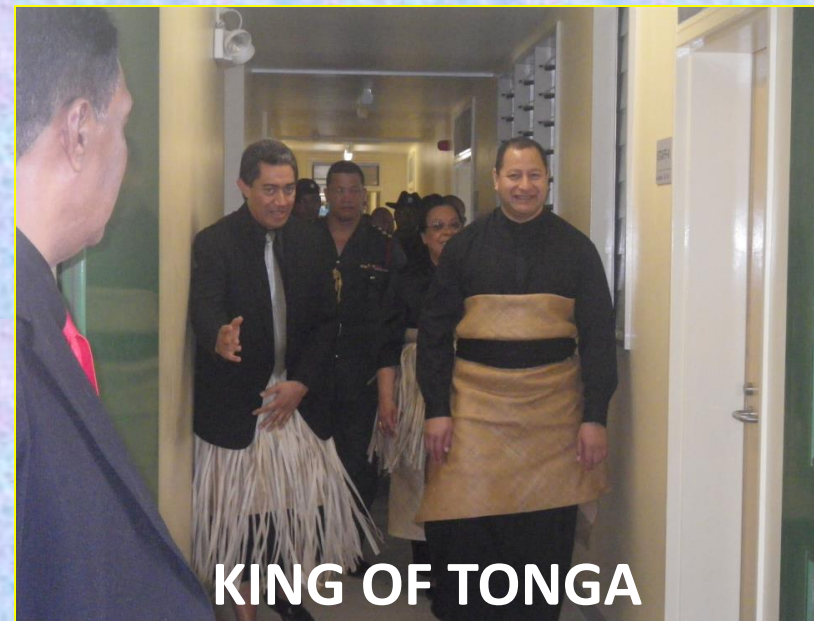
KING OF TONGA

OFFICIAL OPENING OF NEW VAIOLA HOSPITAL DENTAL CLINIC BY KING TUPOU VI IN 2012