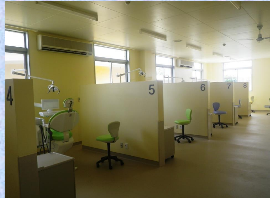
DENTAL DEPT(11 CHAIRS)